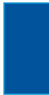
Full Page 6 col. (9.89") X 21" 126 column inches