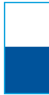
Half H Page 6 col. (9.89") X 10.25" 61.5 column inches

Space Deadline: Wednesday, March 7 th at 3pm